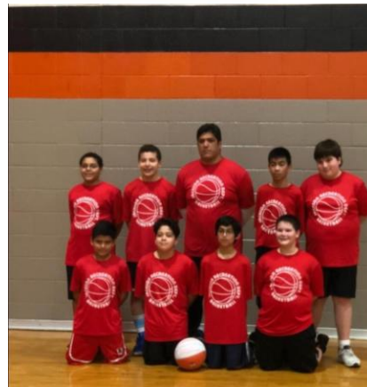
St. Mary Star of the Sea – Shining Stars!