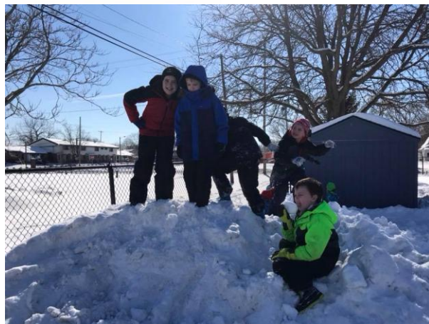
St. Mary Star of the Sea – Shining Stars!

HAVE A HOUSE FULL OF UNUSED TOYS AND CLOTHES AFTER THE HOLIDAYS? Declutter your house and make some money at the same time! Sell your kids unwanted items at the SALE at Lumen Christi Catholic School March 24, 2018 8am - 12 pm Rent a table to sell your new and gently used infant through preteen clothes, maternity items, toys, and accessories to sell to other parents and the general public. OR Do you have a family friendly service or product or make handcrafted items? This is a great opportunity to showcase your business! Only $15 for a single table or $25 for a double! To register, pick up a registration form from the