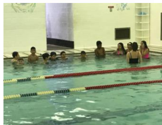
St. Mary Star of the Sea – Shining Stars!

HAVE A HOUSE FULL OF UNUSED TOYS AND CLOTHES AFTER THE HOLIDAYS? Declutter your house and make some money at the same time! Sell your kids unwanted items at the SALE at Lumen Christi Catholic School March 24, 2018 8am - 12 pm Rent a table to sell your new and gently used infant through preteen clothes, maternity items, toys, and accessories to sell to other parents and the general public. OR Do you have a family friendly service or product