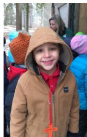
St. Mary Star of the Sea – Shining Stars!