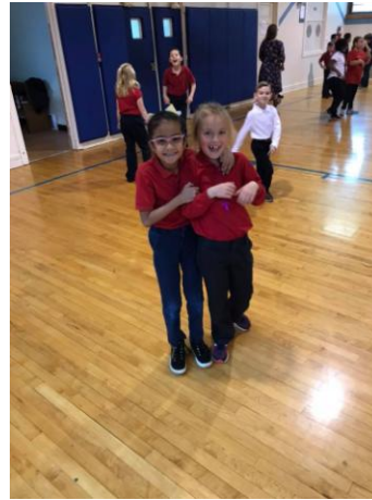
The St. Mary's Difference!

FORMED: stmaryjackson.formed.org (Code: 7DRGZ9)