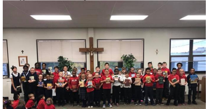
St. Mary's "Bring Your Bible to School Day"